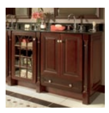
□ Traditional. Timeless. Warm and comfortable elegance.